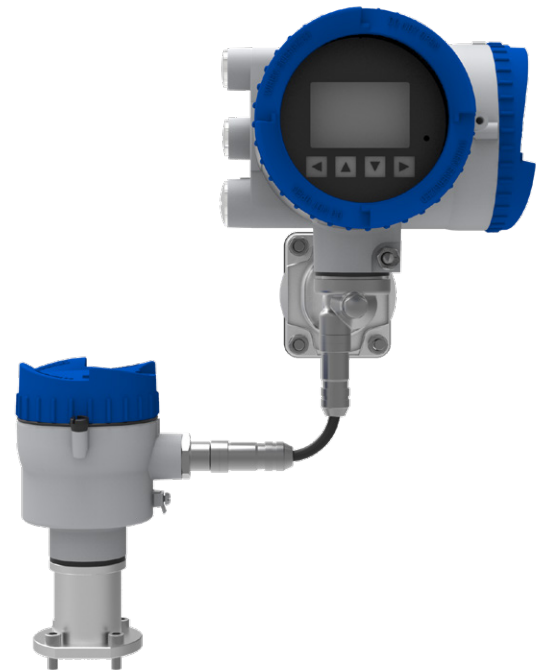
Remote Version (wall mount)